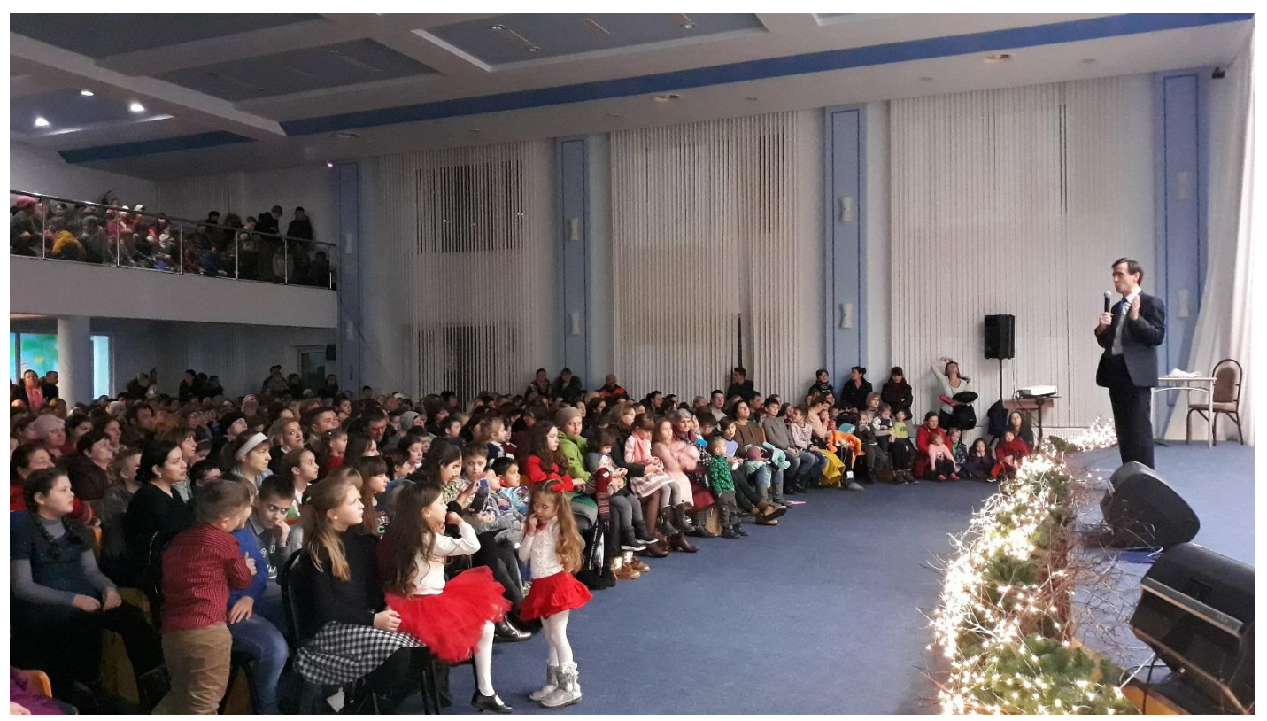
Moreover, all these people do not belong to the church. The youth prepared a Christmas production. There was a brief sermon. And in conclusion, all the children received Christmas presents.

On December 24 , Monday afternoon, in our church, Bethany , a special Christmas service for children was held. Children living in the area where the church is located were invited to this service. A record number of parents and children responded to the invitation - about 800 people attended the service.